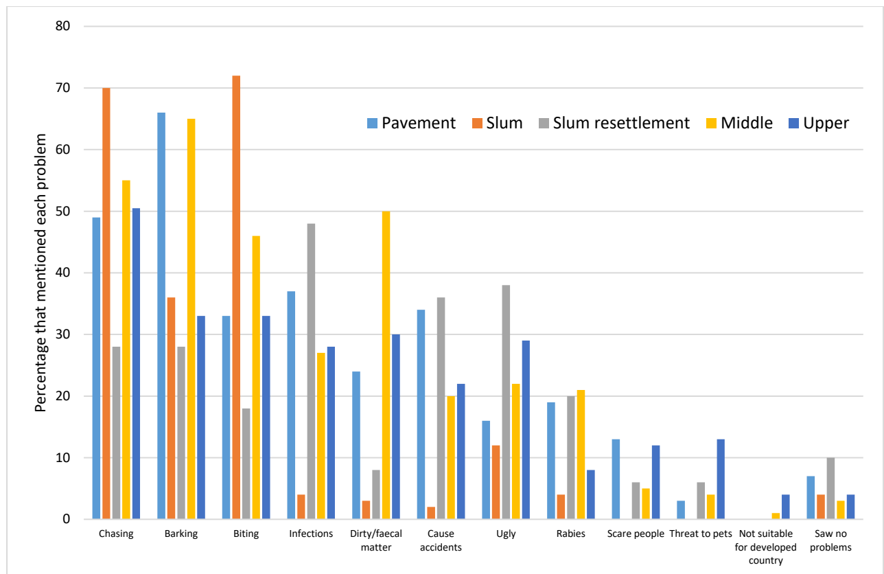
Figure 4. Percentages of respondents in each SES group who mentioned each form of problem when asked if they thought there were any associated with street dogs.

Policy implications: The survey data on complaints points to the need to rethink the emphasis on rabies in many public health and dog welfare campaigns. Rabies is not the biggest worry from the point of view the person on the street. Therefore, programmes aimed at addressing human-dog conflict need to move beyond a narrow focus on rabies to address a broader range of human-dog interactions (barking, chasing etc.) that arise over everyday experiences of cohabitation.